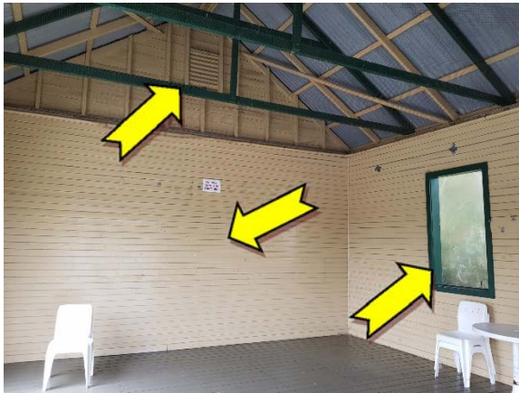
Photo 3. Interior, throughout, walls, frames and beams – suspected lead-containing yellow and green upper coloured paint systems.