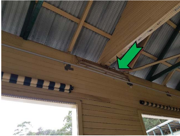
Photo 1. Interior, throughout, single tubed fluorescent light fitting – suspected non PCB-containing capacitors.