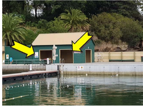
Photo 2. Exterior, throughout, walls and frames – suspected lead-containing green and yellow upper coloured paint systems.